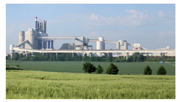
The SCHWENK cement factory Bernburg