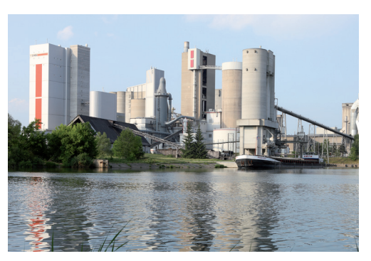
The SCHWENK cement factory Karlstadt am Main