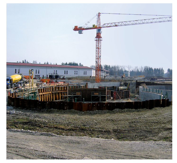
Treatment tank of a sewage treatment facility, made with CEM I 32,5 N-SR 3