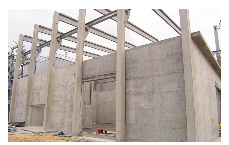
Industrial hall, concreted with CEM II/A-M (V-LL) 42,5 N