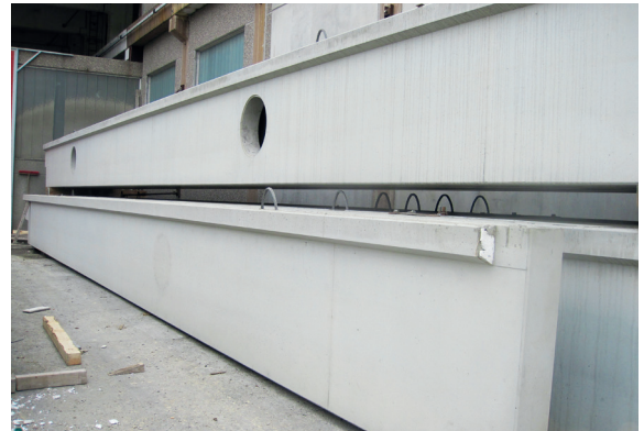
Prefabricated parts, concreted with \textbf{Fastcrete}^{\texttt{@}} plus