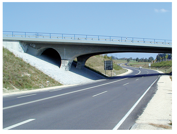
Bridge, built with Portland limestone cement CEM II/A-LL-32,5 R